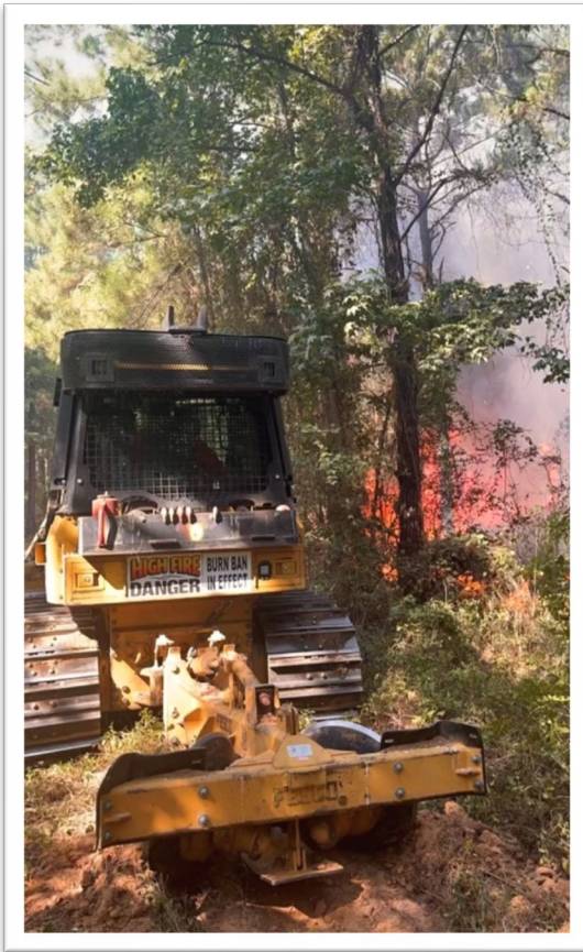
Tractor Plow 2 working Snow Hill Fire (fire activity shown in photo not representative of what was observed at the time of the incident)

At this time, Noah was operating the tractor plow with Dylan as the swamper. Jack was scouting down Harrell Road to ensure there were no additional spot fires, and he tied in with Tractor Plow 2 shortly after. Due to the dexterity needed to manipulate the controls of the tractor plow, Noah was not wearing gloves. Likewise, Dylan was actively using Field Maps on his phone in order to map the progress of line production, so he was not wearing gloves either. Neither Noah nor Dylan were wearing a shirt underneath their Nomex shirt. The fire activity they were experiencing at this time was low with 2-3' flame lengths and a slow rate of spread. They were constructing plow line as direct as possible but having to pick routes around trees in some areas. These pockets of unburned fuel were not burned out at the time because Jack hadn't reached their location yet, and Dylan did not have enough experience to handle the burnout operation safely. After about an hour from the time they unloaded, Jack was feeling the effects of the heat. To prevent becoming overheated, he proposed to Noah that they swap so that Jack could operate the tractor plow and cool down in the air conditioning in the cab. That plan was agreed upon, so they halted line production. Noah exited the tractor plow, and he started donning his line pack while Jack started removing his. Where they stopped, there was approximately 30-40 feet of unburned fuel between their plowed line and the fire edge.