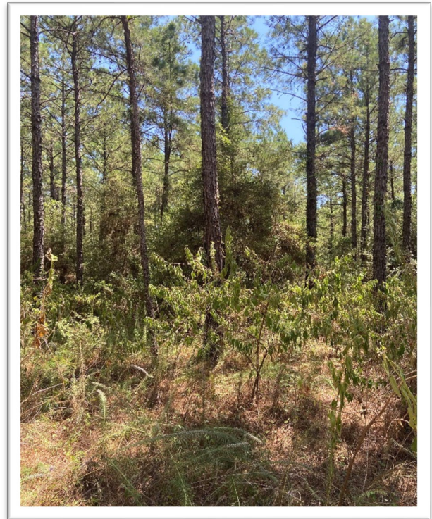
Representative fuels near the incident site

When TAMFS resources were requested to assist local fire departments on the Snow Hill Fire in San Jacinto County on August 2, they arrived to find approximately 10 acres burning with moderate to high fire behavior in a thinned loblolly pine plantation with the potential for rapid growth and threats to homes. Given the time of day (approximately 13:30), conditions, and potential of the fire, more resources were ordered, including additional dozer and tractor plow units, engines, and aviation resources. There was already an ambulance on scene that came with one of the local fire departments, but an Emergency Medical Task Force (EMTF) that was staged in Jasper, approximately 90 miles away, was also requested due to the potential for heat related injuries for responders. Some of the additional resources ordered included two tractor plow units from the nearby TAMFS office in Huntsville. Tractor Plow 1 was staffed with an Initial Attack Tractor Plow Operator (TPIA) and a Firefighter Type 2 (FFT2) as a swamper. Tractor Plow 2 was staffed with Noah, a qualified TPIA, Jack, also a TPIA and Heavy Equipment Boss (HEQB), and Dylan, a FFT2.